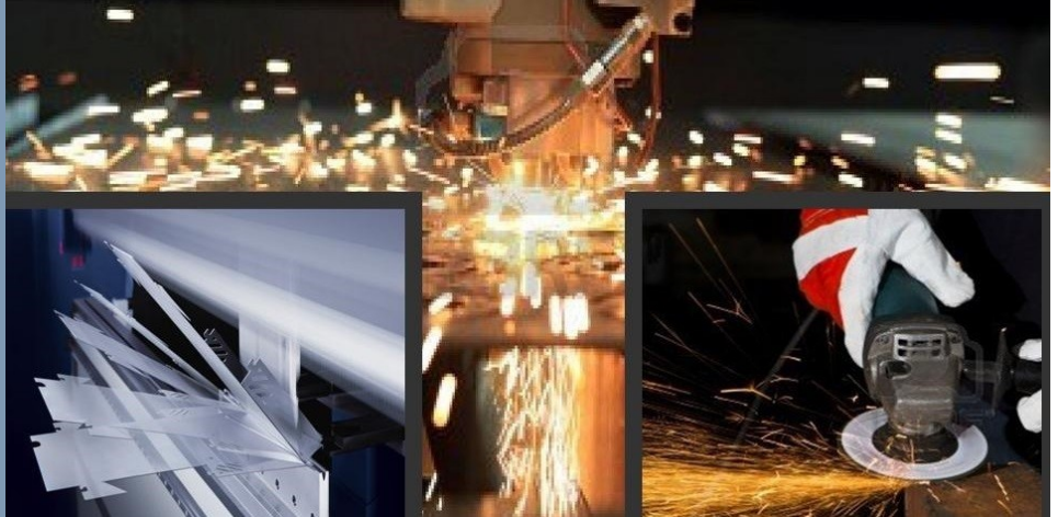
Sharpline Stainless Steel