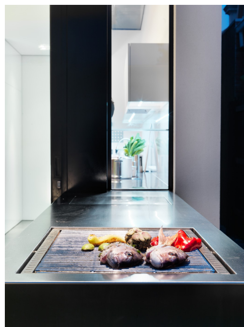
Domestic BBQ - Fitzroy, Melbourne