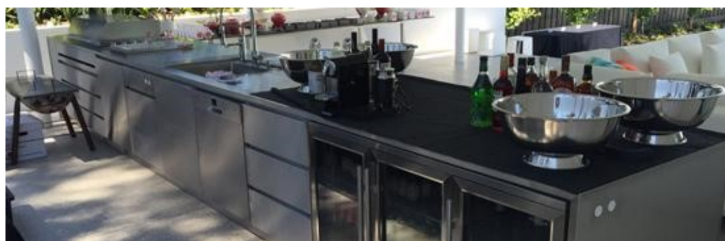
Alfresco Living - Ivanhoe, Melbourne